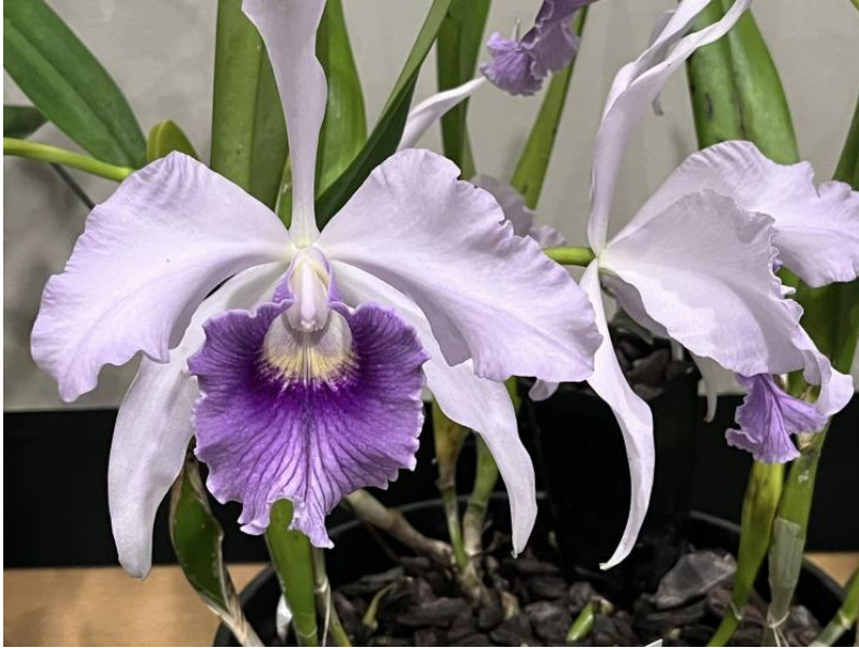
December Open Orchid of the night Cattleya Canhamiana , grown by Rob Rough

This is a primary Hybrid between Cattleya mossiae and Cattleya purpurata created by Veitch in 1885. It is very easy to grow and does not require extra treatment as it grows with the other cattleyas in the glasshouse. It has been in my possession for a long time. It grows in low light in the middle section (knee high) of the glasshouse which is covered with shade cloth in winter due to the deciduous tree nearby shedding its protective leave. The shade cloth is removed once the tree grows a sufficient canopy to offer protection from the sun. Rob Rough