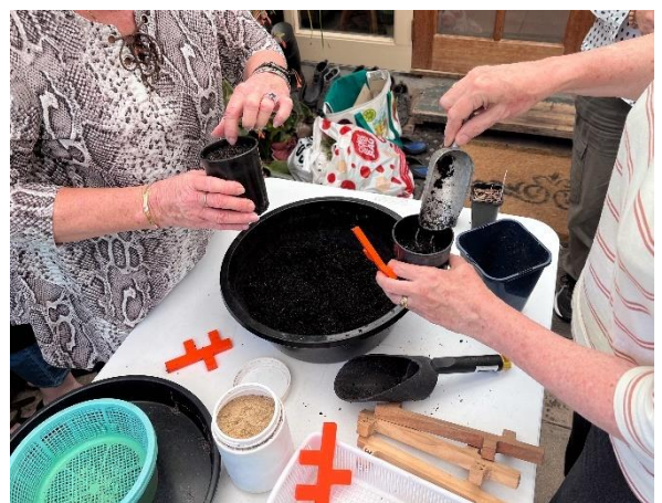
Members filling their own pots.